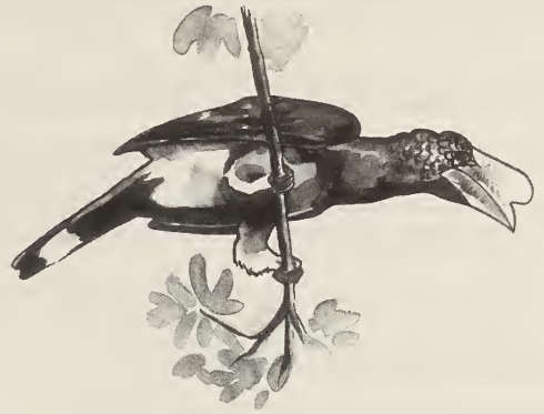
Silvery-cheeked Hornbill Ceratogymna brevis by Mark Andrews

Motacilla flava Yellow Wagtail; status: abundant; p rec: 11; sites: 6; # zones: 5; zones: 2, 3, 4, 7, 10; month: 2, 3, 4, 10, 11; altitude: 50–2,500 comments: Feb migration in coastal lowlands